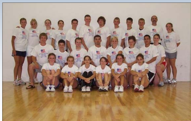
2006 USA Junior National Team

Congratulations to Team Mexico for a hard-fought, well-deserved victory!